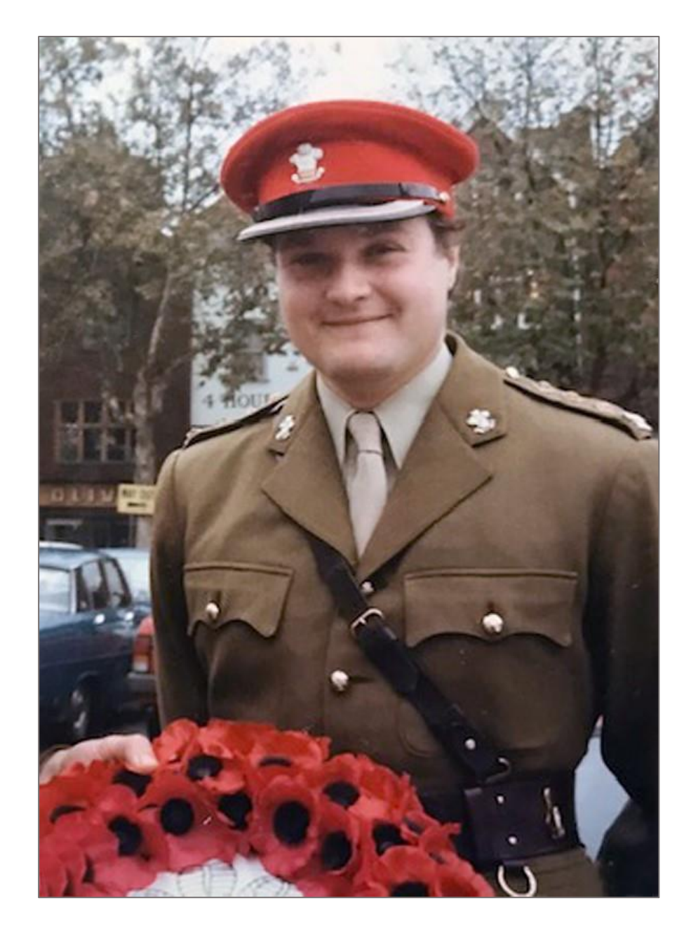
Requiescat in Pace

A Requiem Mass for the repose of the soul of