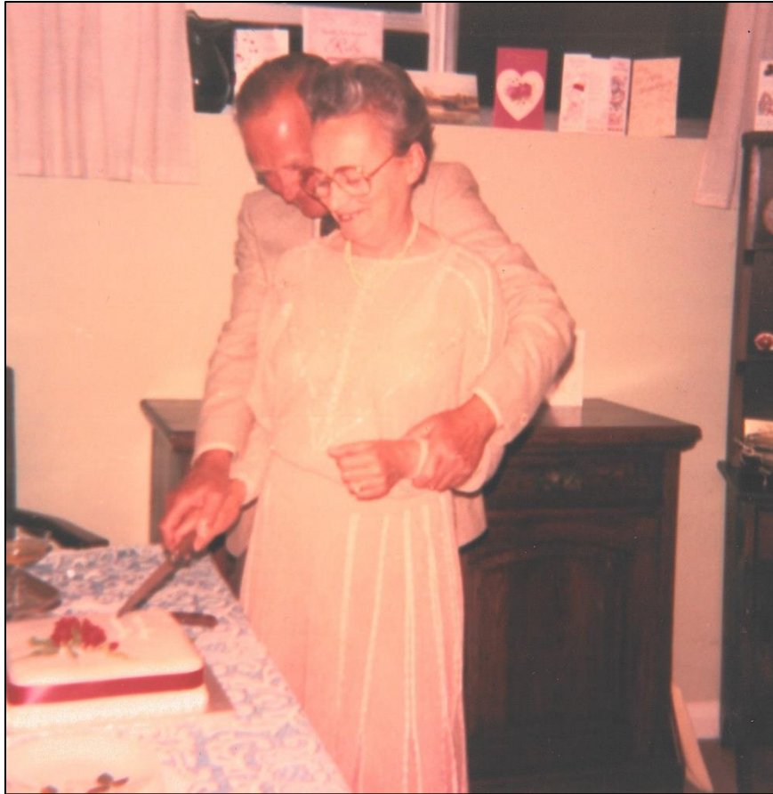
'Ruby Wedding Anniversary'