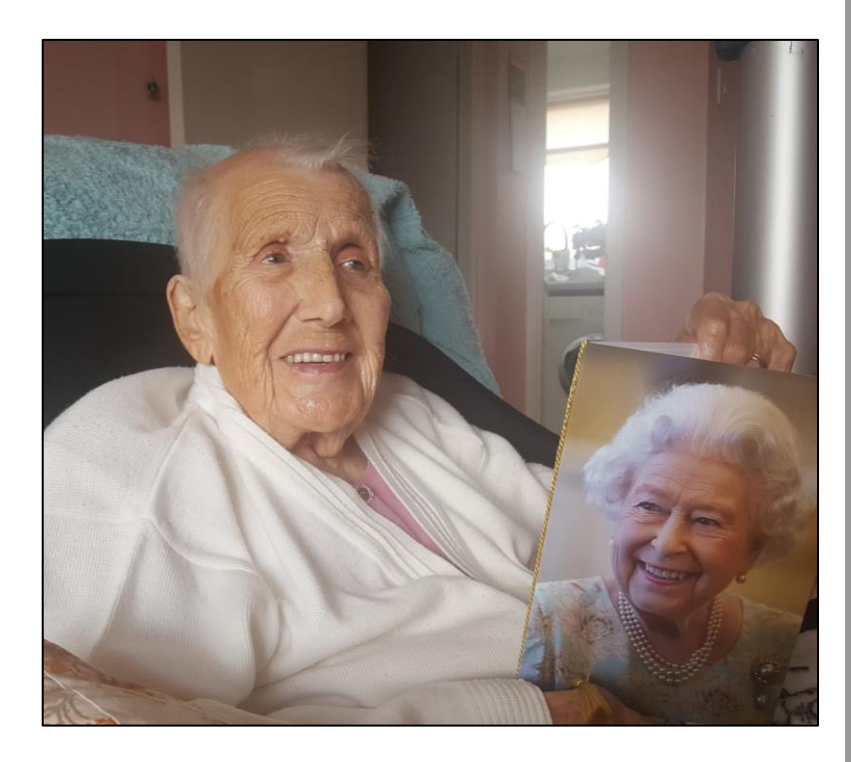
18 years old