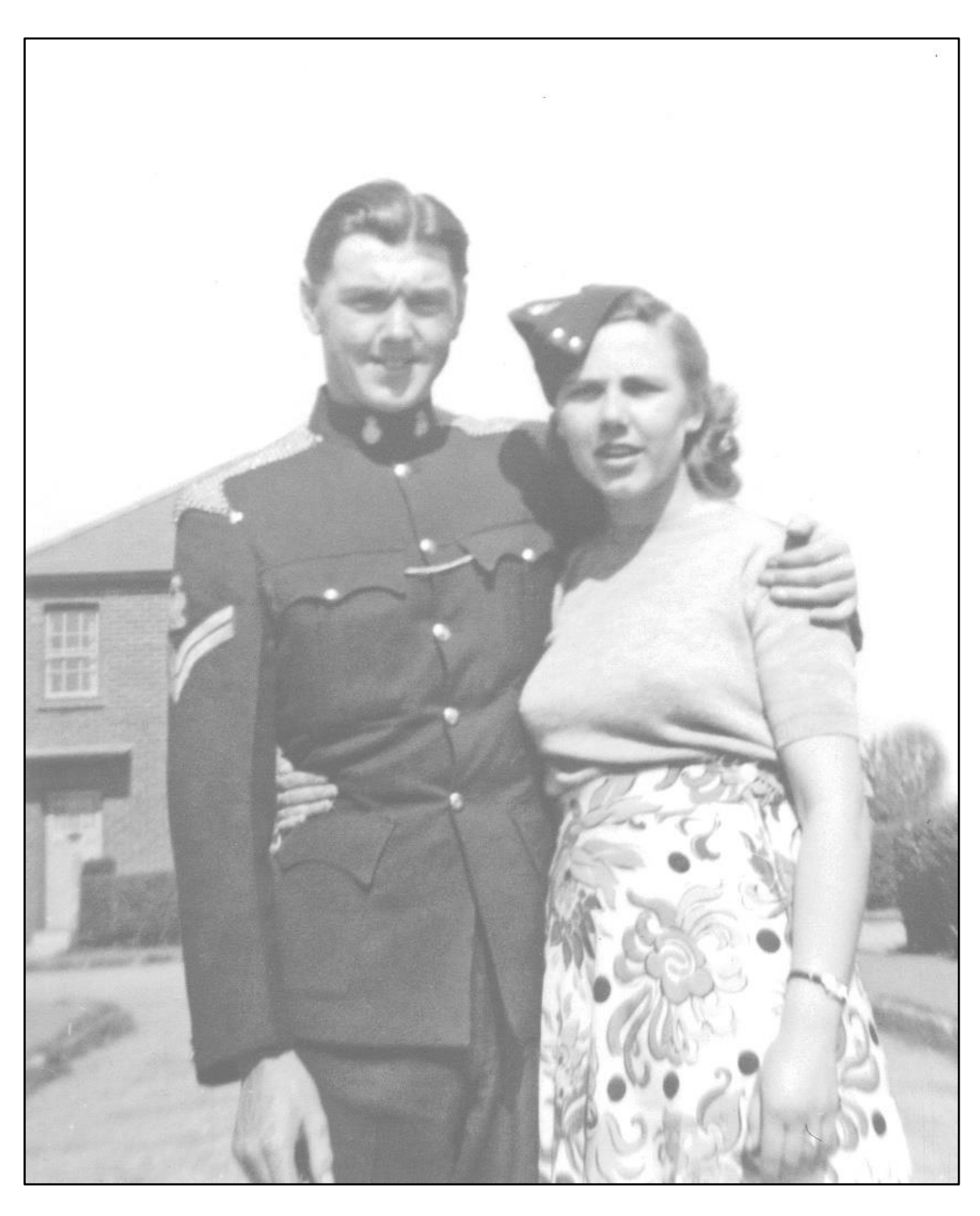
Together in Life – Reunited in Death