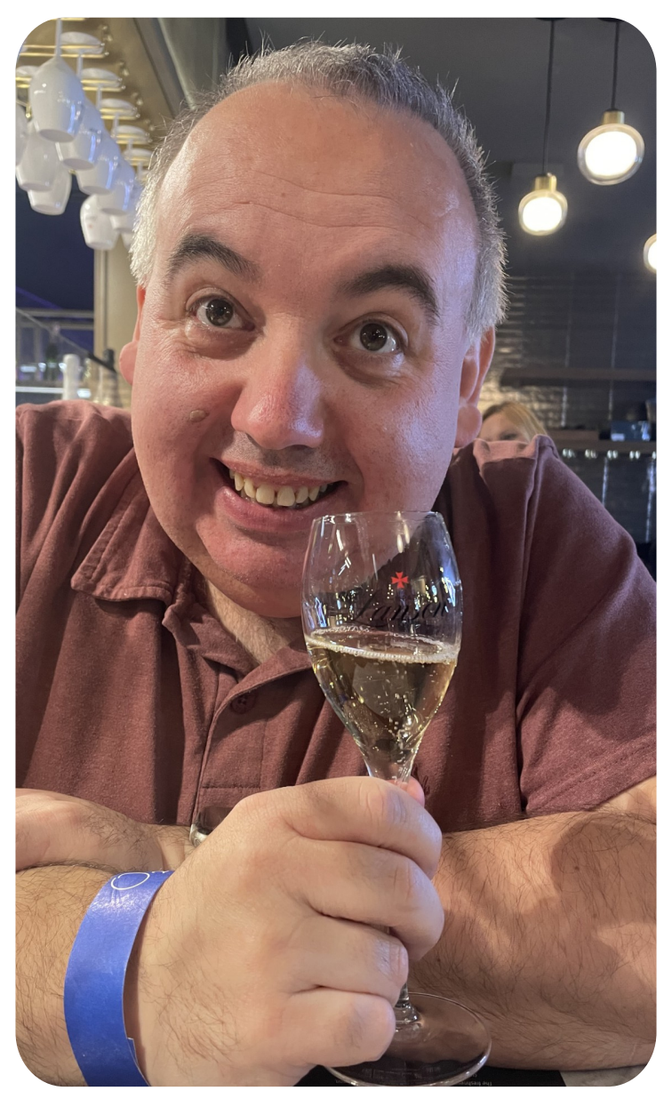
Halo Ceremony Hall Poole Crematorium

18<sup>th</sup> December 1975 ~ 9th April 2025